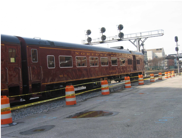
NS 42 "Tennessee". The new excursion coach and power car.

On a visit to Roanoke shortly after the March excursions, Mike Tilley was able to capture images of vintage rail cars not only in current service but also under restoration for future use.