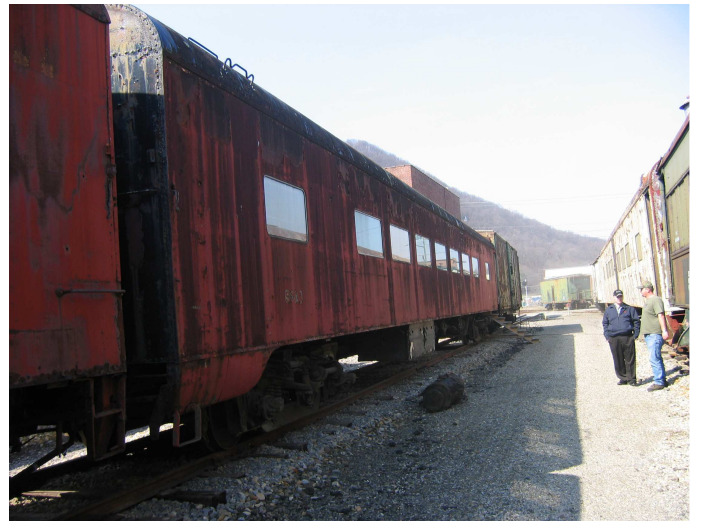
Ex-N&W coaches 534 (left) and 538 (right) undergoing restoration at the Roanoke Coach Yard.