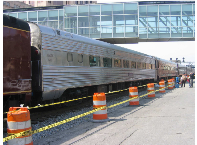
WATV 500. Note that WATV on the letter board has been removed in preparation to adding FEC markings when the car is renamed to its legacy "St. Augustine".