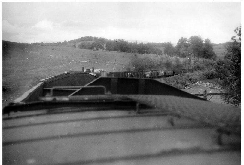
The Saltville Branch as seen from an engine cab.

The first time I was force-assigned to the Second Saltville run, it was as the middle brakeman, and then later I was force-assigned again, this time as the flagman. I also caught one-week vacation relief assignments on Saltville jobs several times later while working the Roanoke Extra List, and usually deadheaded down on No. 41 to cover them. If I was sent down for a week on the First Saltville Shifter, the 7am job, I would ride No. 17 out of Roanoke at 9:16pm the night before. We always deadheaded by passenger train back then, and sometimes by freight train, riding in the caboose. Any conductor would haul you as long as you told him you were deadheading.