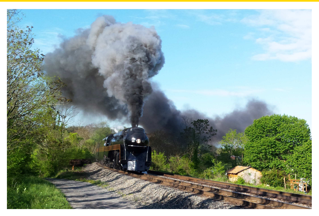
Just can't get enough of the 611 under steam. This magnificent May 7<sup>th</sup> shot of the locomotive climbing Southwest Virginia's Blue Ridge grade trailing a dramatic plume of smoke was taken by railfan Brian Crosier.