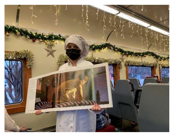
The story is read with illustration from the book.