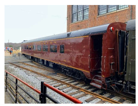
This was our car, a Norfolk Western #44 "Florida", named Jingle for the Express.