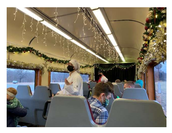
The show and ride begin.