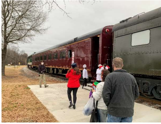
Walking to our car for loading. Our car was the first car behind the locomotive.