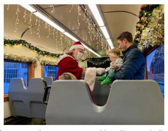
Santa greeting everyone and handing out bells.