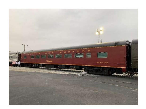
Powhatan Arrow #539 served on Train A. It was named "Blitzen"