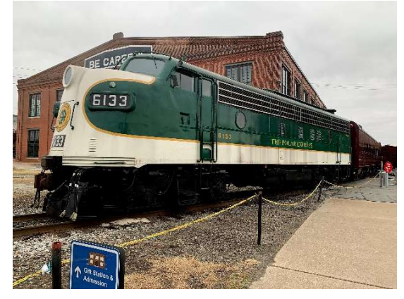
Locomotive # 6133 EMD FP7 pulled our Train A.

Hope this finds everyone well. This month I wanted to share some photos from our adventure on the Polar Express Train Ride at the North Carolina Transportation Museum in Spencer, NC. Our ride was on December 21<sup>st</sup>. We were scheduled to ride on Train A (Car: Jingle). Unfortunately, this was not one of our 4 cars that was being used. We started the morning touring the museum itself and all it had to offer. That Tuesday was a very cold day, and a lot of the exhibits are in buildings that have no heat. I would recommend warmer weather for the best experience.