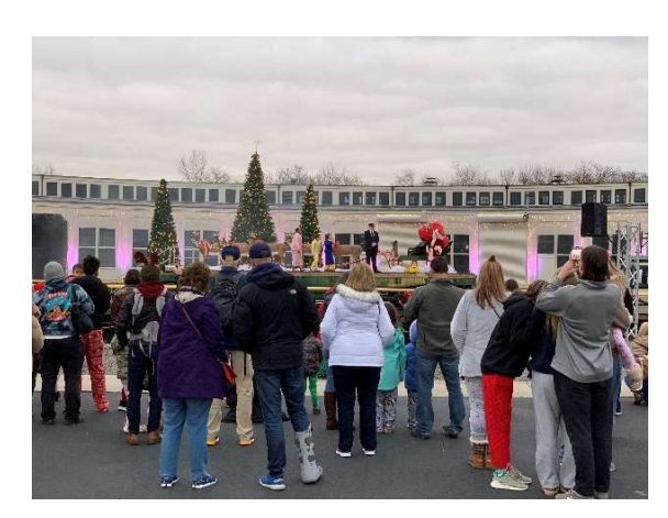
A stop at the North Pole with singing and dancing.