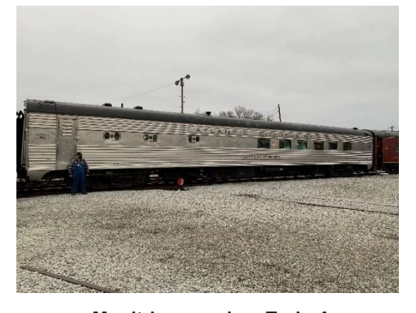
Moultrie served on Train A. It was named "Holly".