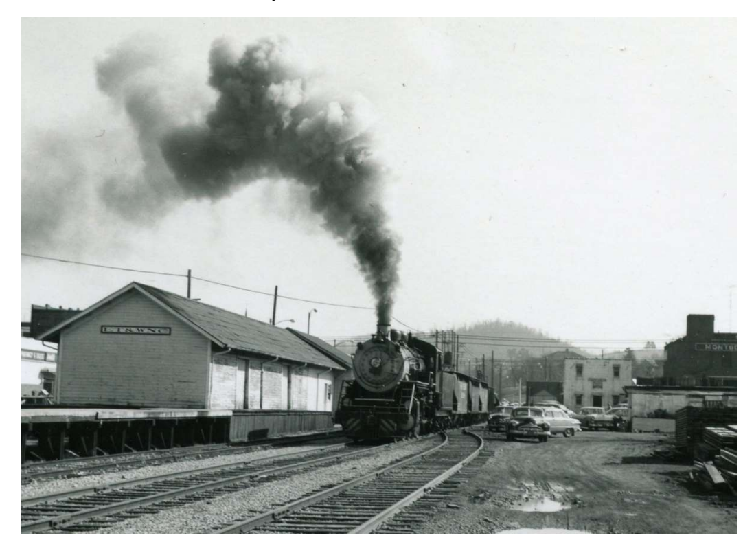
ET&WNC 2-8-0 #208 works the east end of Elizabethton, TN, steaming past the freight house. The empty coal cars suggest a return from Coal Chute? (Although too late for the narrow gauge.) [Gilbert Collection, March 1958 photo]