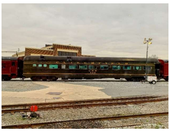
Clinchfield Car 100 served on Train B It was named "Cupid".