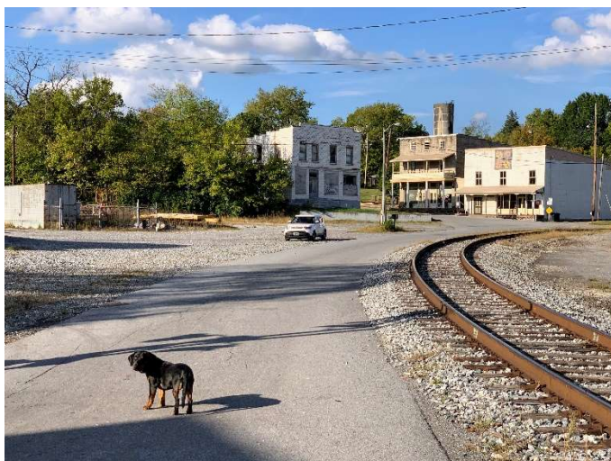
In railfanning, I have met a lot of interesting animals. Dogs, Horses, etc. This dog which lived beside the Museum wanted to make friends but just wasn't sure of me. I am sure if I had stayed longer, we could have become good buddies.