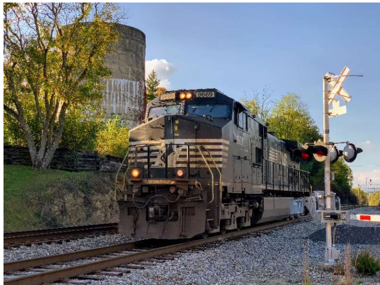
To the left and below we see the switcher 9669 crossing over S. Main Street crossing. On the left up on the hill, looks to have been an old concrete water tank.