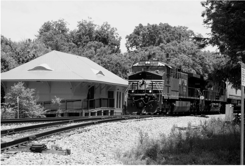
[Left] No visit to Jonesborough would be complete without a shot of a train coming by the Chuckkey Depot. This appears to be an Intermodal train heading west.