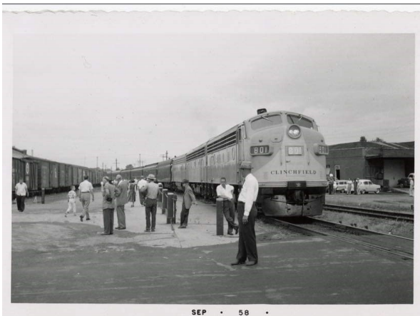
SEP • 58 •

[Left] Clinchfield Railroad - 1959 employee excursion, picture at the station on Buffalo street in downtown Johnson City. Clinchfield's # 801 on point, an EMD F7A built in 1948.