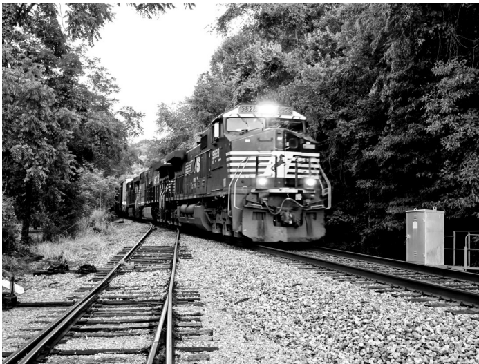
[Left] This could be a familiar sight to some. This is looking out from the WVRHS&M coach yard as NS 16T motors past. I was waiting for the Greeneville Switcher to pick up our coaches.