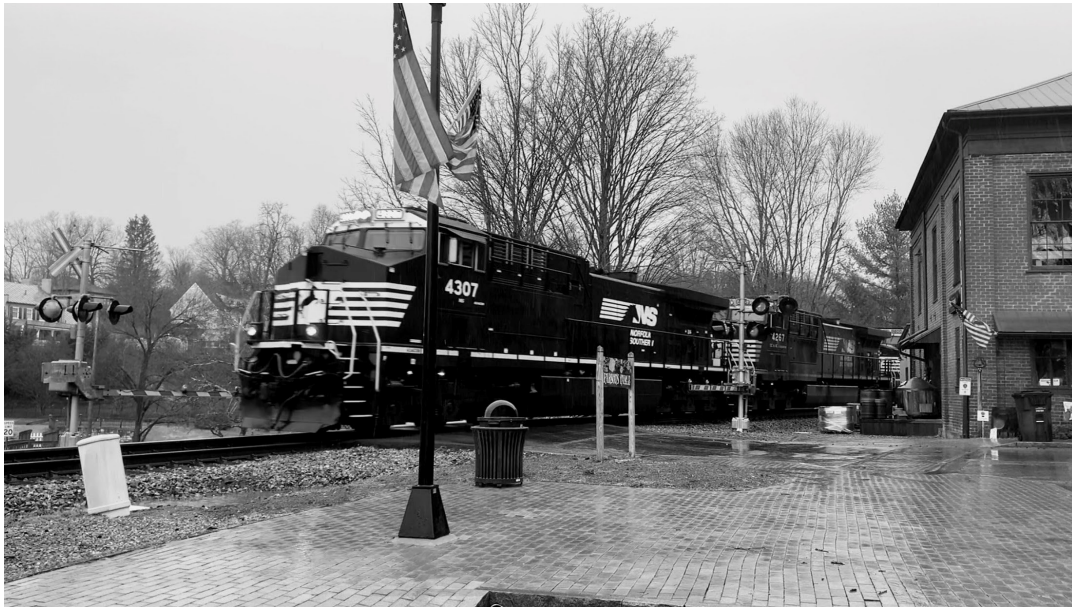
[Above] Westbound NS 127 rounding the Salt House on a rainy Friday afternoon. A little rain never stops getting a good image.

Happy Fall!! This is one of the best times of the year. With the Fall foliage and cooler temps, make it the finest season for getting out and about to watch and photograph trains. Although this month I will be displaying some of my Jonesborough Black and White images. Color will return next month. So get out and watch trains and enjoy the season.