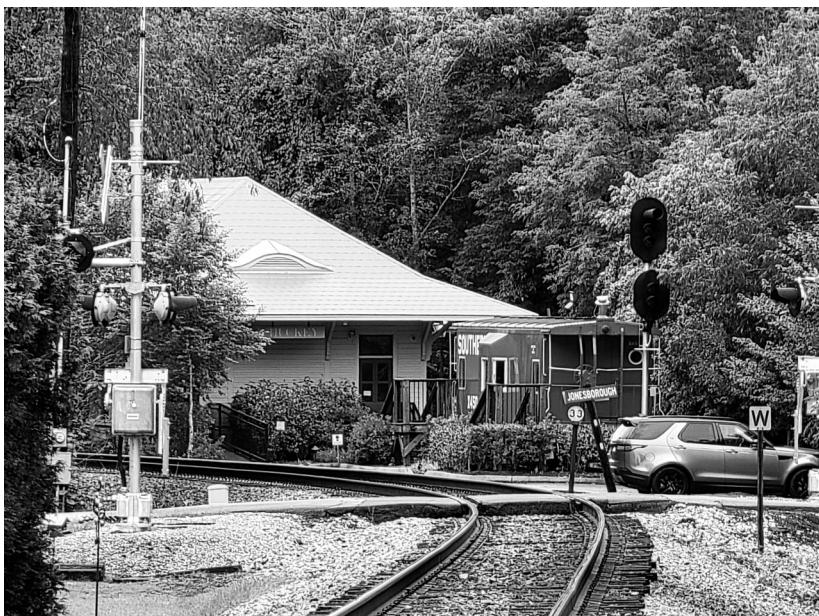
[Left] A zoomed in shot down the tracks toward the Chuckkey Depot from a closed 1st street crossing. One might hope that a train will emerge from around the bend.