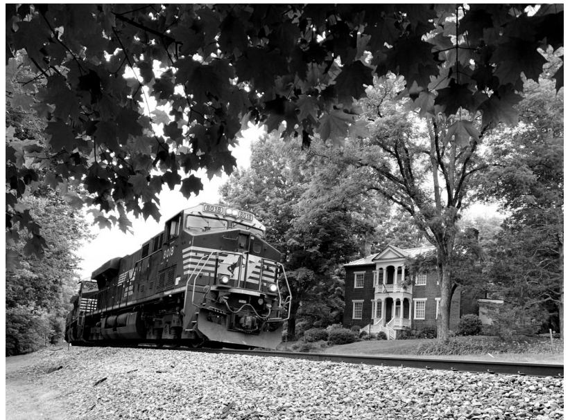
[Right] A westbound as it makes it's final curve into Jonesborough. I thought this was very appropriate for a B&W with the old residential house in the background.