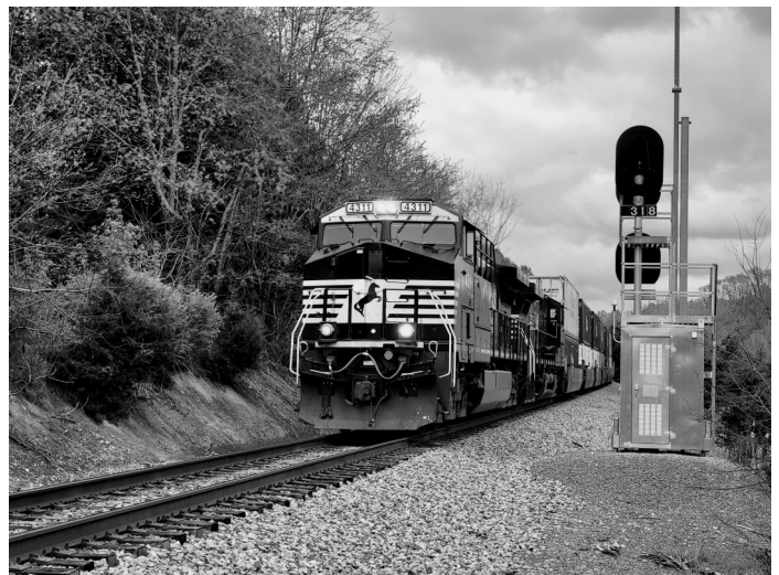
[Right] At MP 31.7 we have a NS Double Stack as it will be rounding some curves and making it's way into the downtown area. You can always hear the conductor calling out this signal.