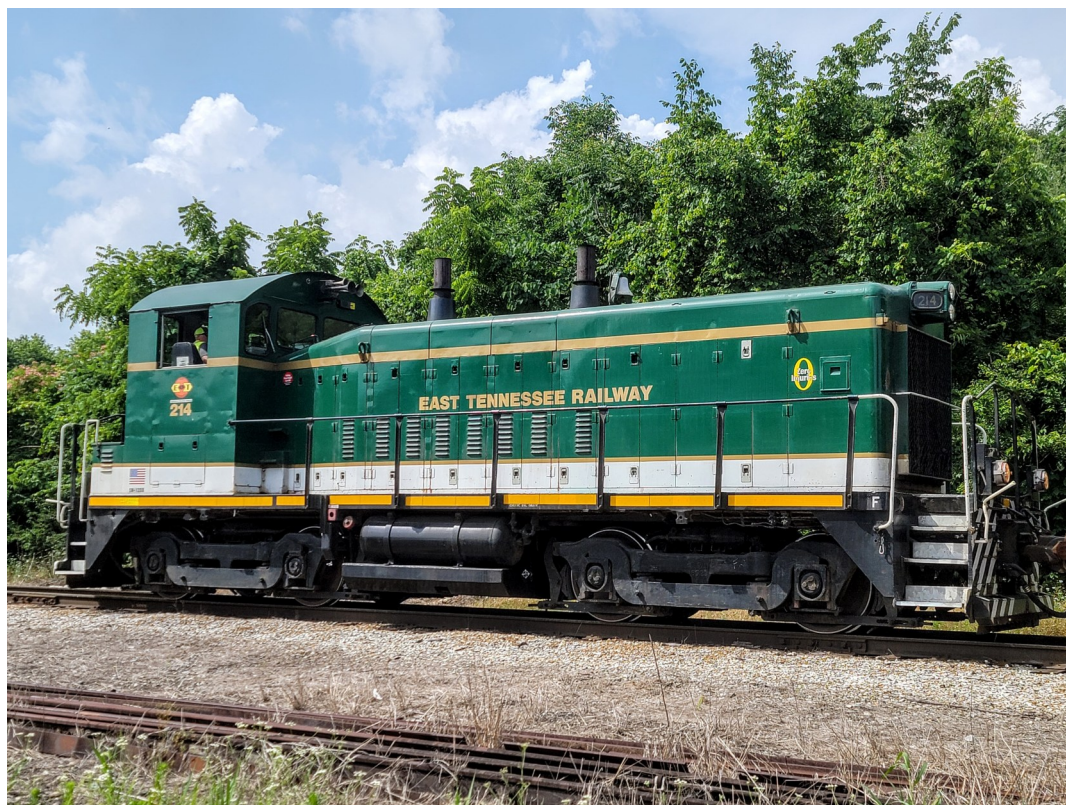
A piece of local rail history has left the area. Story on page 4.